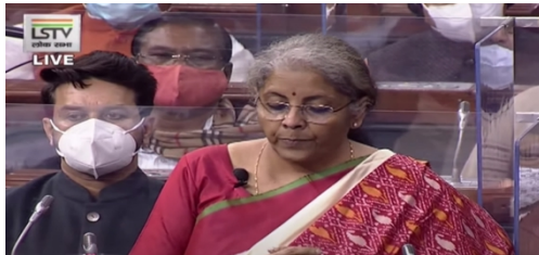
Indian Minister for Finance & Corporate Affairs, Nirmala Sitharaman presented the Union Budget 2021-22 ( Watch Speech )